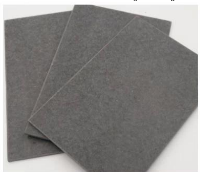
Hot Sale China Cement fiber shingles siding