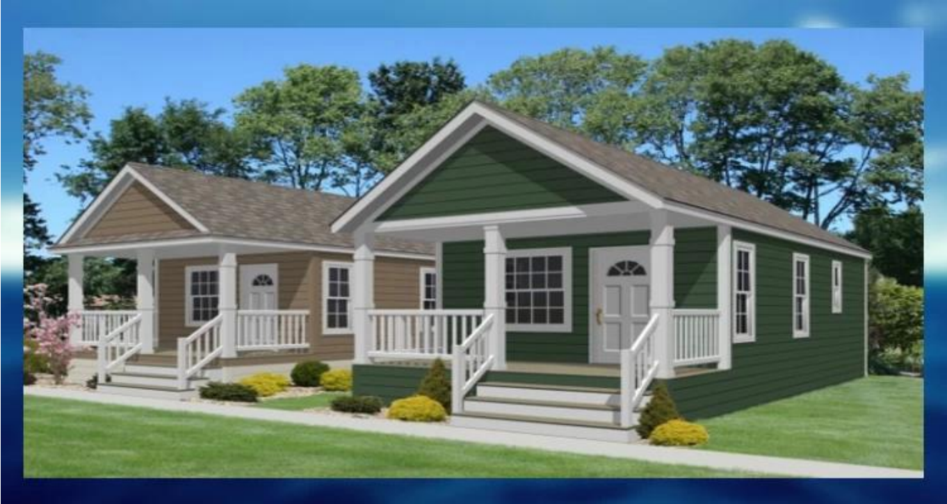
HEYA Superior Quality Prefab Modern House Made in China