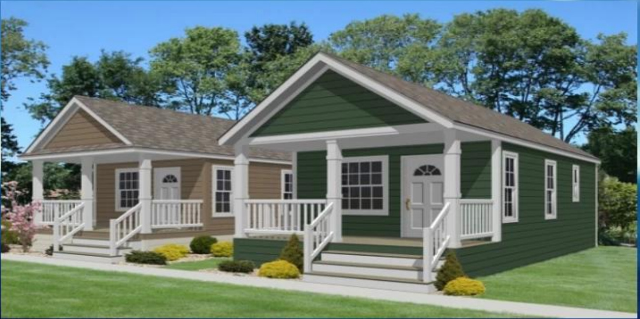
HEYA Superior Quality Prefab Modern House Made in China