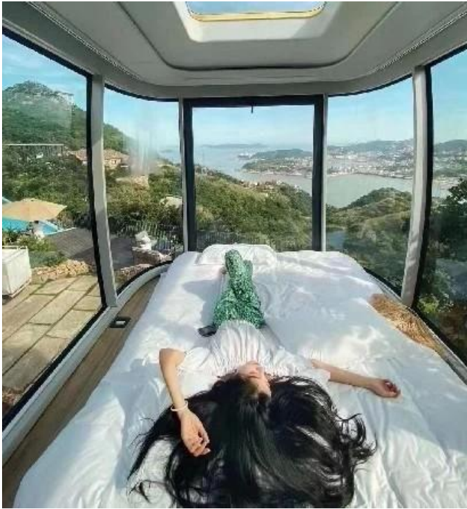
270° Floor-to-ceiling window, good insulation Sleep in the scenery, enjoy the beauty of nature