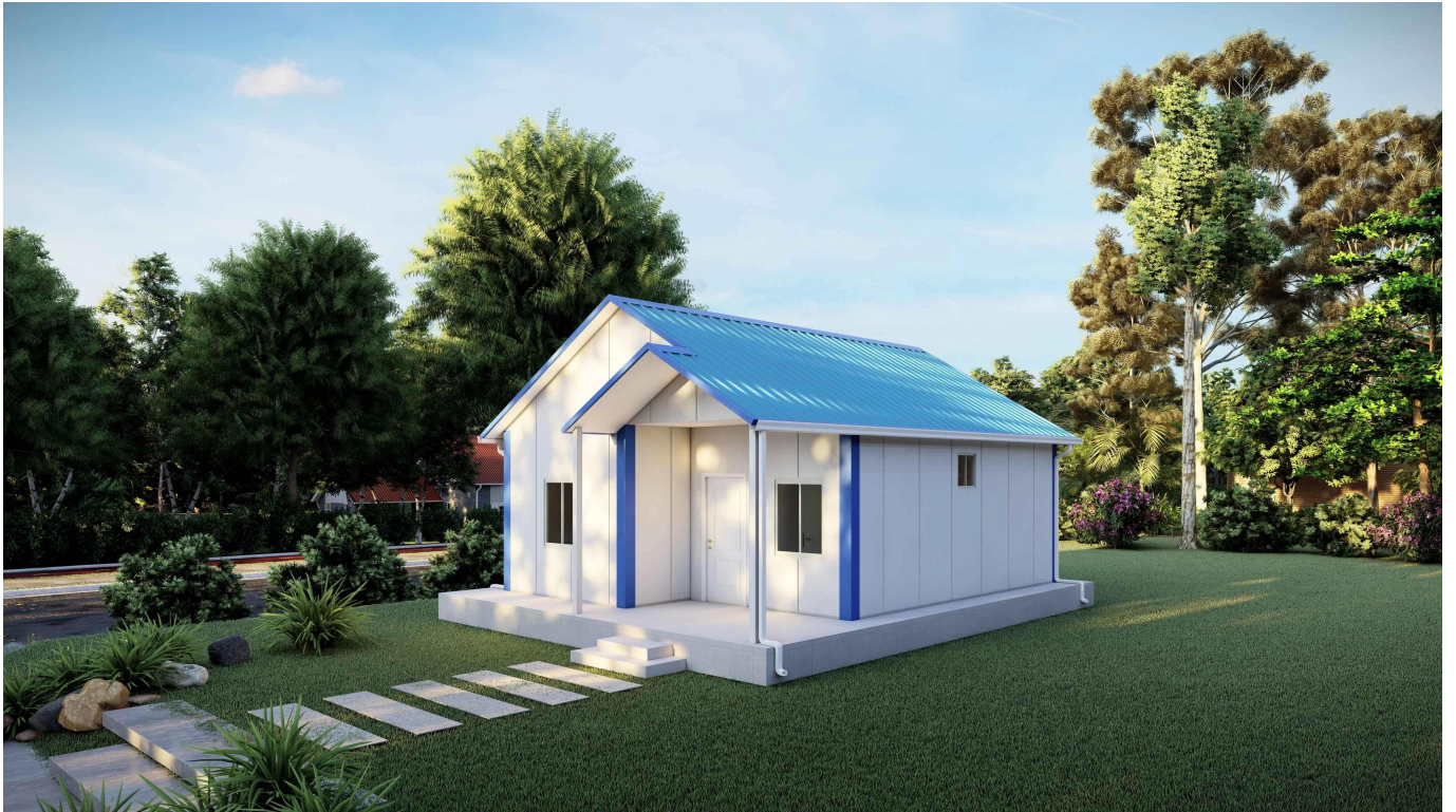
China 2 room sandwich panel house ready made prefabricated granny flat house - 2B02